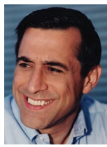
Rep. Darrell Issa