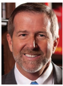
Rep. John Campbell