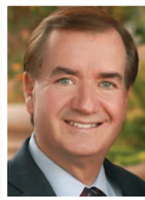
Rep. Ed Royce