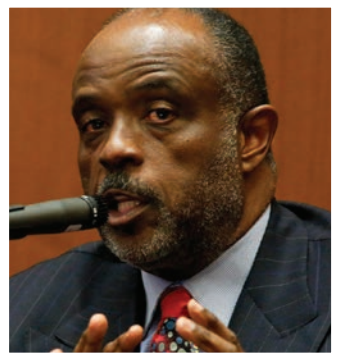
State Senator Rod Wright