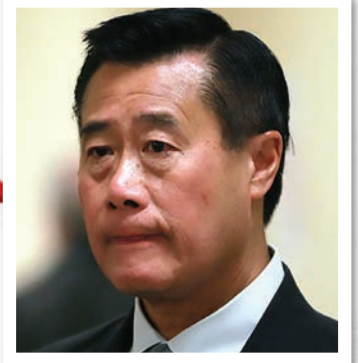
State Senator Leland Yee