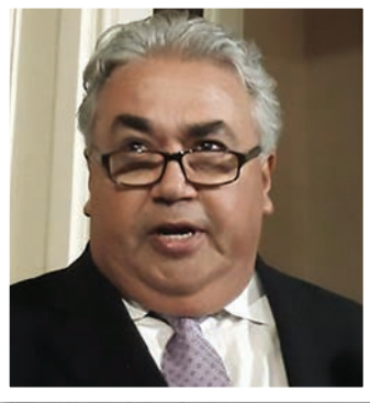
State Senator Ron Calderon