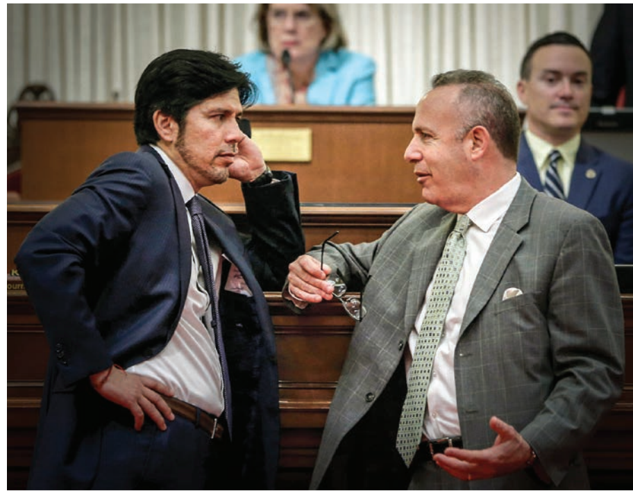
New Senate Boss Kevin de León